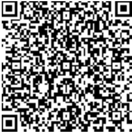
QR code for registration tickets

To find the auction webpage go to https://www.nwuuc.org/auction